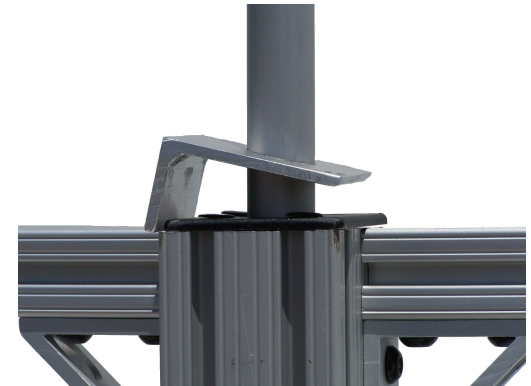
Figure 2. DUZcart locking mechanism (Locked position)