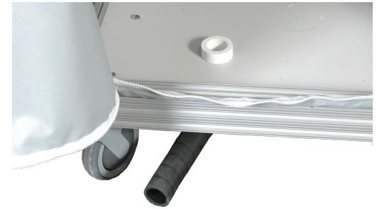
Figure 1. DUZcart HEPA vac hose attachment.

For a complete demonstration video on the use of the DUZcart Dust Containment cart, visit our website: www.DUZcart.com .